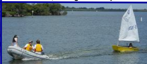
Motor Conked Out or No Wind ?