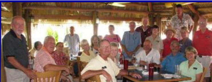
VBPS Lunch Cruise to Cobb's Landing in Ft. Pierce